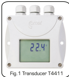
Fig.1 Transducer T4411

Relative humidity at temperature over +85 °C is limited in accordance with the graph. Near plastic case with electronics maximum temperature is +80 °C.