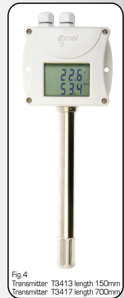
Fig.4 Transmitter T3413 length 150mm Transmitter T3417 length 700mm