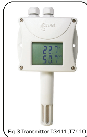
Fig.3 Transmitter T3411, T7410