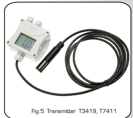
Fig.5 Transmitter T3419, T7411