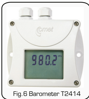
Fig.6 Barometer T2414