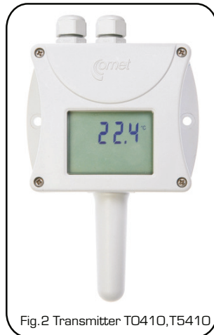
Fig.2 Transmitter T0410, T5410