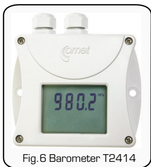
Fig.6 Barometer T2414