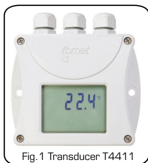
Fig.1 Transducer T4411

Relative humidity at temperature over +85 °C is limited in accordance with the graph. Near plastic case with electronics maximum temperature is +80 °C.