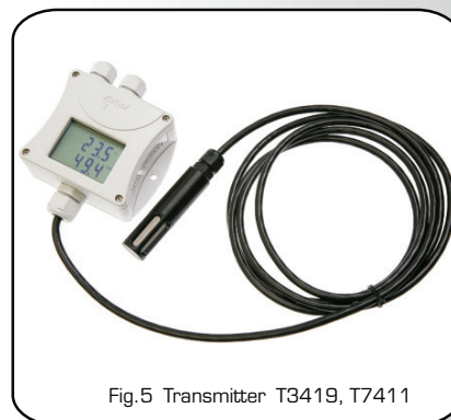
Fig.5 Transmitter T3419, T7411