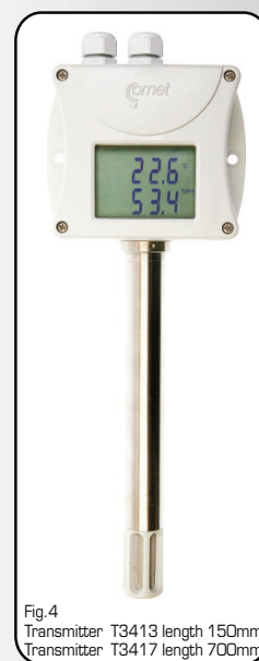
Fig.4 Transmitter T3413 length 150mm Transmitter T3417 length 700mm