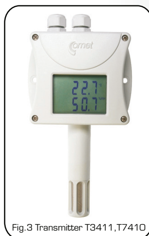
Fig.3 Transmitter T3411, T7410